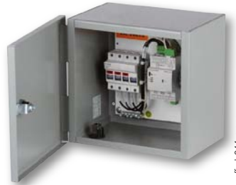
DIRIS DigiBOX 8 Centralization and display of data